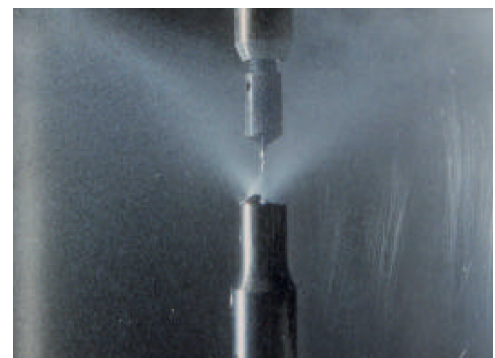
Ultrasonic Atomization of Low Melting Point Alloy and (top left) Gas Atomizer Close Coupled Nozzle

A unique course directed to practitioners and researchers on the principles and practice of powder manufacture by atomization of molten metals